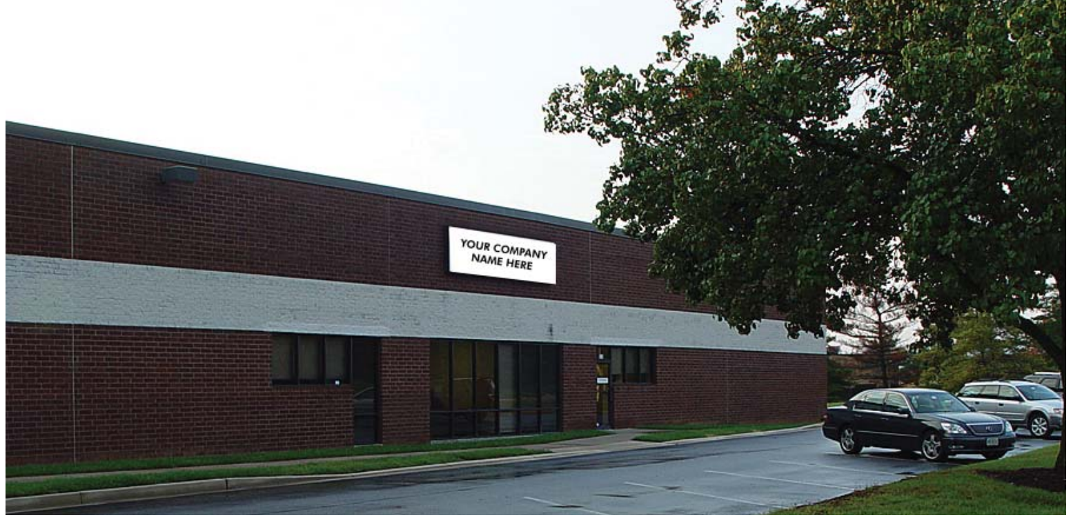
Photos herein are the property of their respective owners and use of these images without the express written consent of the owner is prohibited.

TOR LEASE 336 CLUBHOUSE LANE HUNT VALLEY, MD 21031